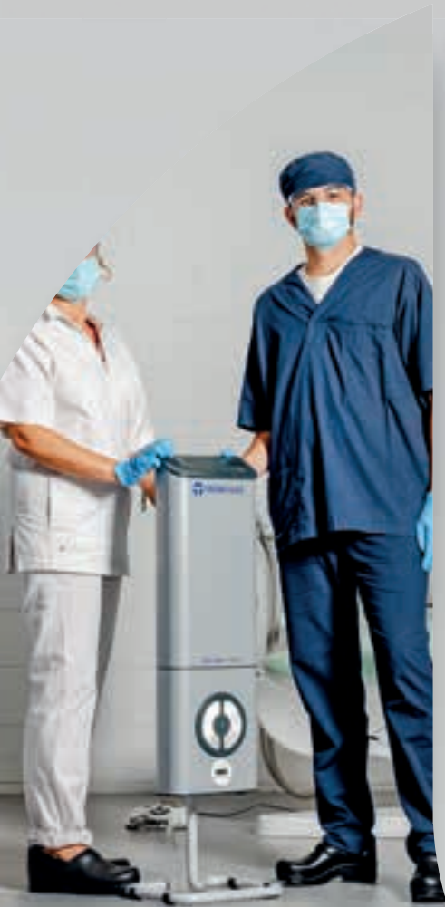
Air treatment and safety of patients/operators