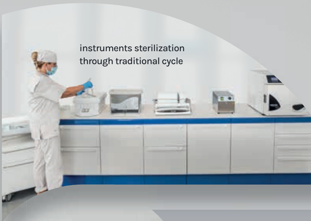
instruments sterilization through traditional cycle