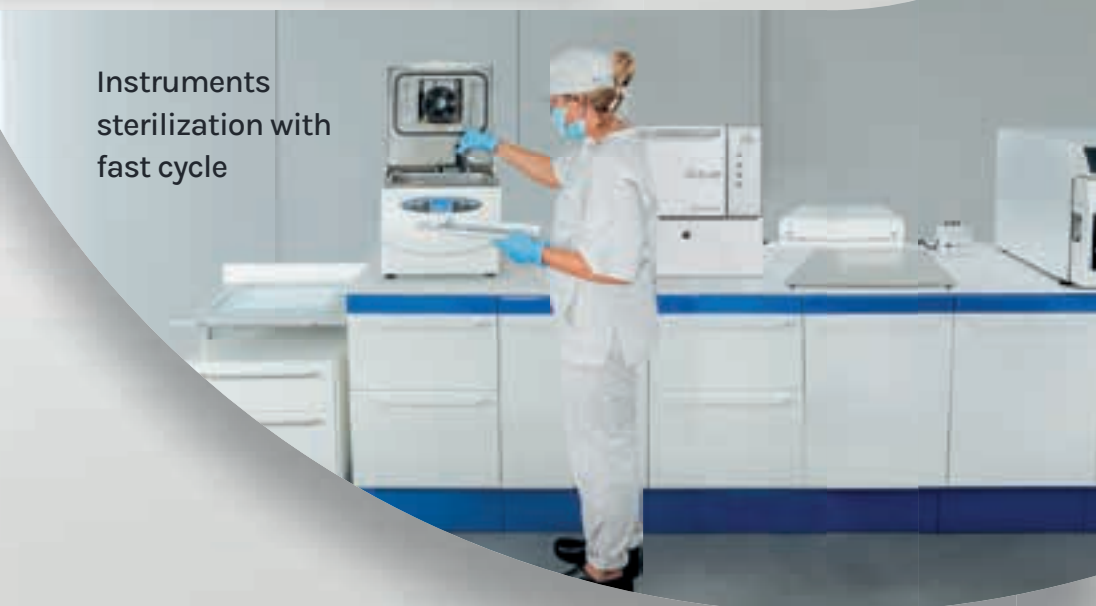
Instruments sterilization with fast cycle